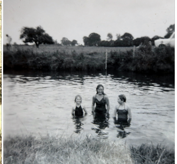
Oxborough Ferry about 1910; Photo of girls in the river in the 1960s

Drop in session with refreshments provided by Oxborough History Group – donations invited